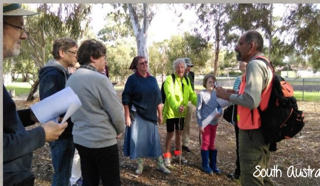
South Australia meeting

In NSW and VIC, ARA directors have recently visited some Christian conference centres to provide ecological advice and to discuss opportunities for future A Rocha involvement.