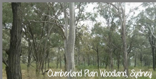
Cumberland Plain Woodland, Sydney

In NSW and VIC, ARA directors have recently visited some Christian conference centres to provide ecological advice and to discuss opportunities for future A Rocha involvement.