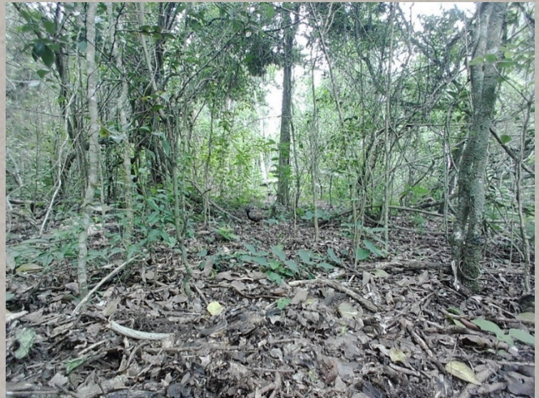
Semi-evergreen vine-thicket at Redwood Park, female Button-Quail at centre (remote camera image)

Sub-tropical climate, rich volcanic soils, moderate rainfall and 170 vears of exposure to nonplants have contriindigenous buted to major infestations of weeds in this part of Queensland. At Redwood Park, FEP has been helping Council to combat a suite of weeds that persistently threaten destroy endangered ecoto systems, notably, 40 ha of semievergreen vine-thicket ('dry rainforest' or 'softwood scrub'). Cat's claw creeper, Madeira vine and climbing asparagus fern tend to smother the ground layer and tree canopies of the scrub, radically