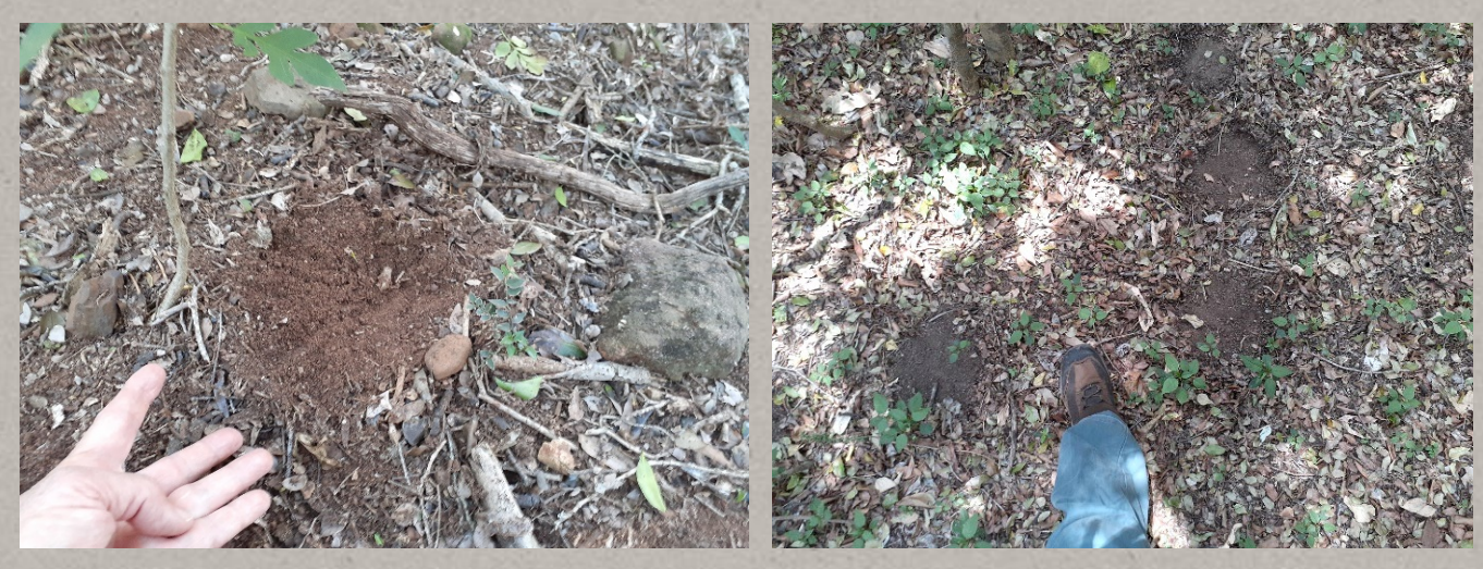
A feeding scrape of a Button-quail