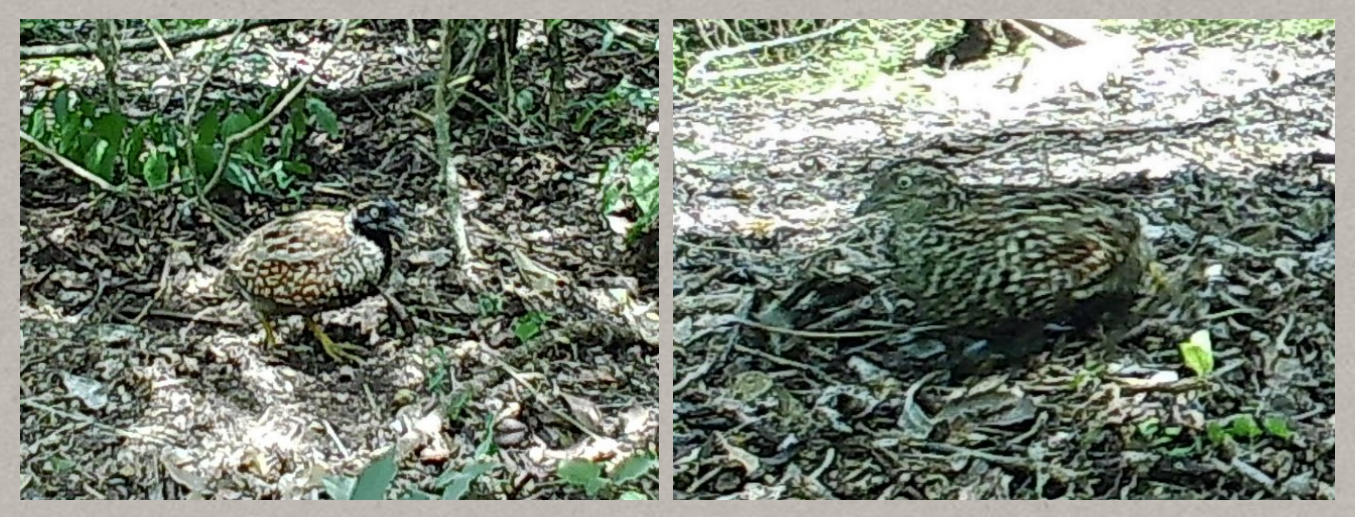
Black-breasted Button-quail, female at left, male at right (remote camera images).

changing the vegetation structure and encouraging even more weeds. Loss of a shaded floor and its leaf litter is believed to have made Redwood Park temporarily uninhabitable for several ground-foraging animals and birds including the Noisy Pitta, Russet-tailed Thrush and Black-breasted Button-quail (Button-quail)—all of which have always had a patchy limited distribution in the Toowoomba region.