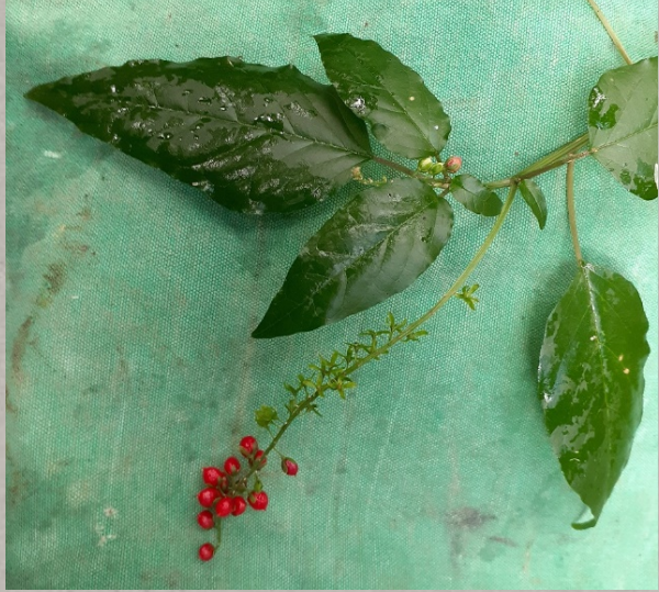
Coral berry: leaves and fruit