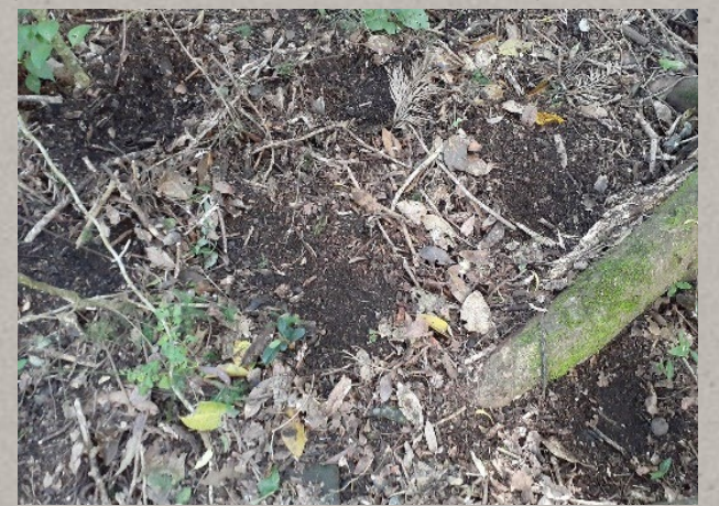
What causes these patterns in the leaf litter? Read on to find out!

It was fantastic to take part in the A Rocha Worldwide Forum Festival in June. I do encourage you to watch some of the video clips from the Festival talks.