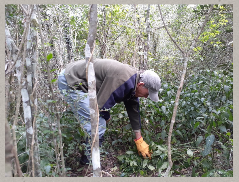
A Rocha Australia team member weeding out coral berry at Redwood Park

... intense stage of a prolonged much drought across of Australia and many stressed trees in Redwood Park died back. exposing more of the ground to sunlight. With good rainfall from summer of 2020 to winter of 2021, the moist conditions led to an explosion of plant growth in the lowest layer, including dense stands of short weeds such as coral berry, cobbler's pegs, Brazilian nightshade and lantana. This phenomenon was another obstacle to the Buttonquail and associated groundforaging birds.