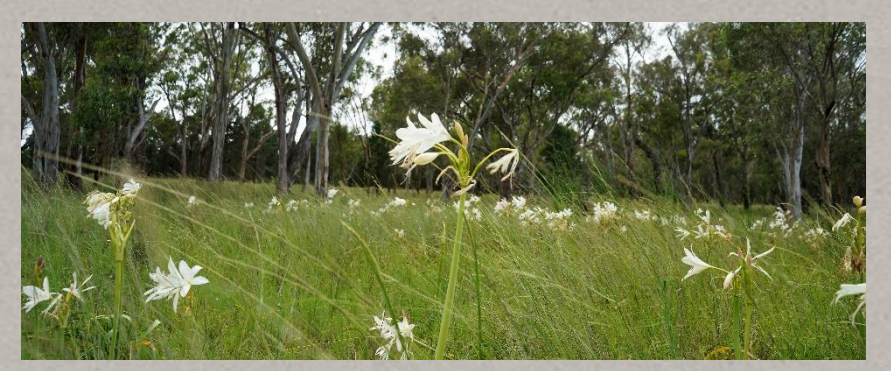
Darling lily - Crinum flaccidum - near Quirindi, NSW

If the environment is so important, why didn't Jesus