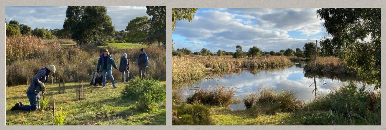
Planting at Hart Road wetlands (Kaurna country) in July 2022