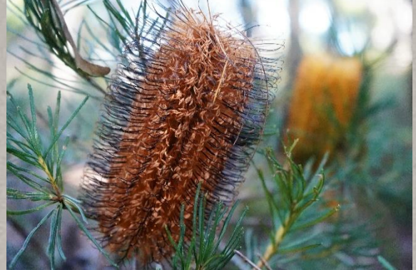
Hairpin Banksia – Banksia spinulosa

On 30 March we held our Annual General Meeting for A Rocha Australia, with members and supporters joining us via Zoom. It's always encouraging to meet together. At this meeting we shared our new-look Annual Report for 2022, which we encourage you to